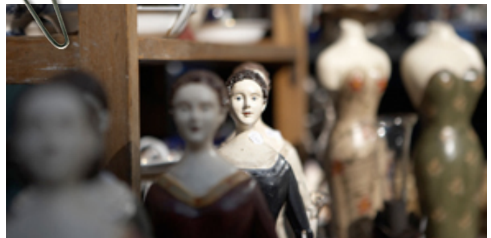
Be Creative and Have Fun