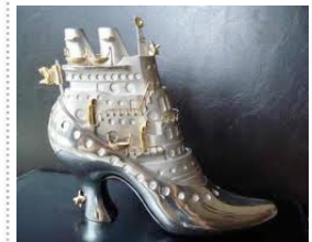
Bring it into the Future

Your teacher is here to help you, to nurture your ideas, to encourage you to succeed!