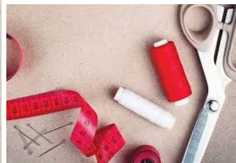
SEWING SUPPLIES ANYONE?