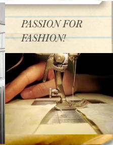
PASSION FOR FASHION!